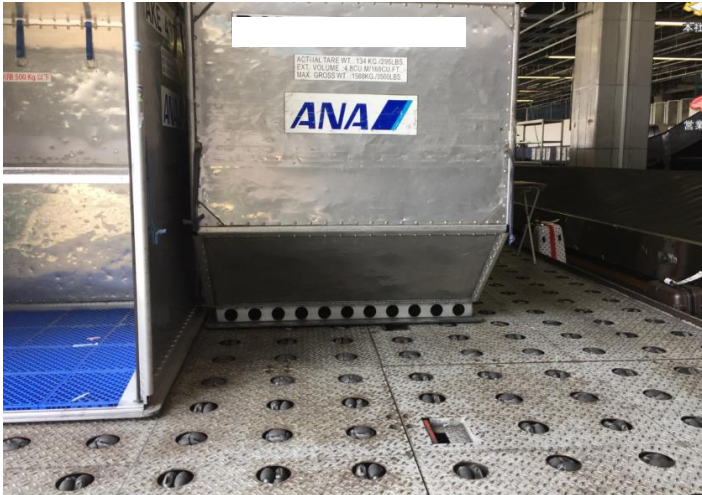
Omni Stage at Air Port